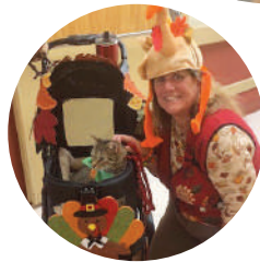
Kitchi the Cat on Thanksgiving

Concord residents and staff can certainly agree with the fact that petting an animal makes them happy! That's because it releases hormones like serotonin, prolactin and oxytocin which are known to improve mood and help people relax. The smiles on their faces when Kitchi, Kasha, Bow Ties, Zayda and Saucalita come to visit say it all!