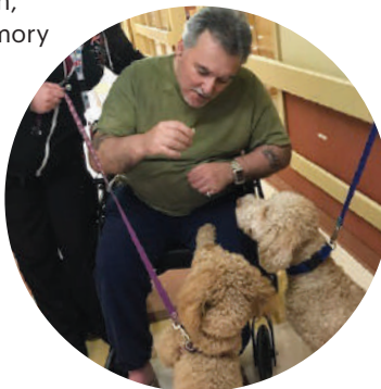
The Golden Doodles: Kasha & Bow Ties

The benefits of pet therapy have also been recognized by the scientific community. UCLA Health shares that not only do animals help to reduce anxiety and loneliness, they also increase mental stimulation, benefiting those with memory issues or who have been impacted by diseases like Alzheimer's. Pet therapy can also help to lower blood pressure, improve cardiovascular health, and in some cases reduce overall pain.